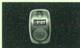
③ Buzzer switch

Getting on Please confirm the destination.