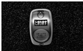
③ Buzzer switch

Getting on Please confirm the destination.