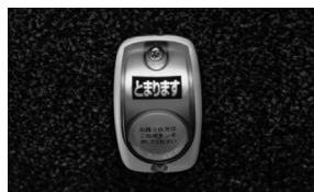
③ Buzzer switch